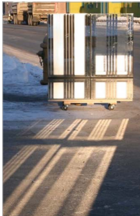
Reflection and transparency