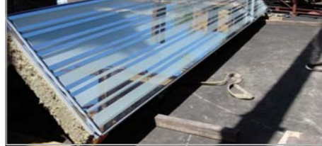
20 foot curtain wall unit