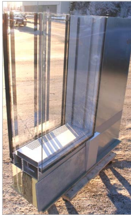
Integrated Heating System